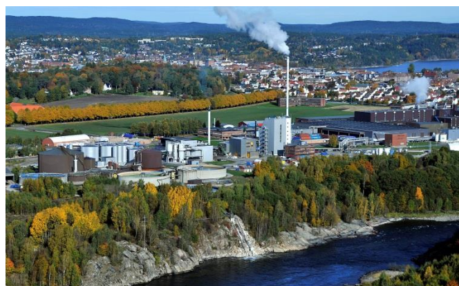
Figure 1: Borregaard plant in Sarpsborg