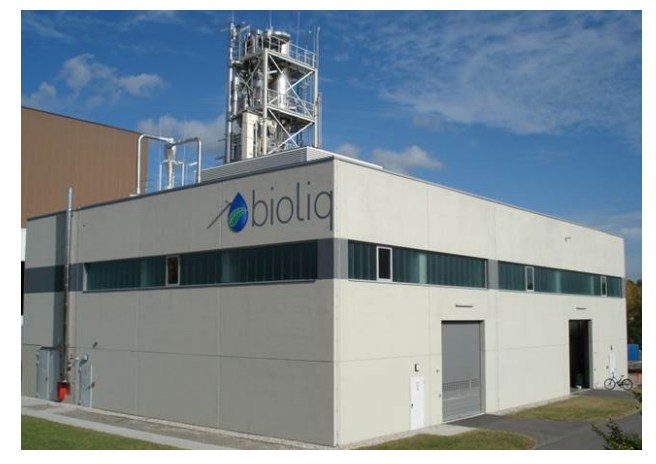
Figure 6: Bioliq plant at KIT in Eggenstein-Leopoldshafen (DE)