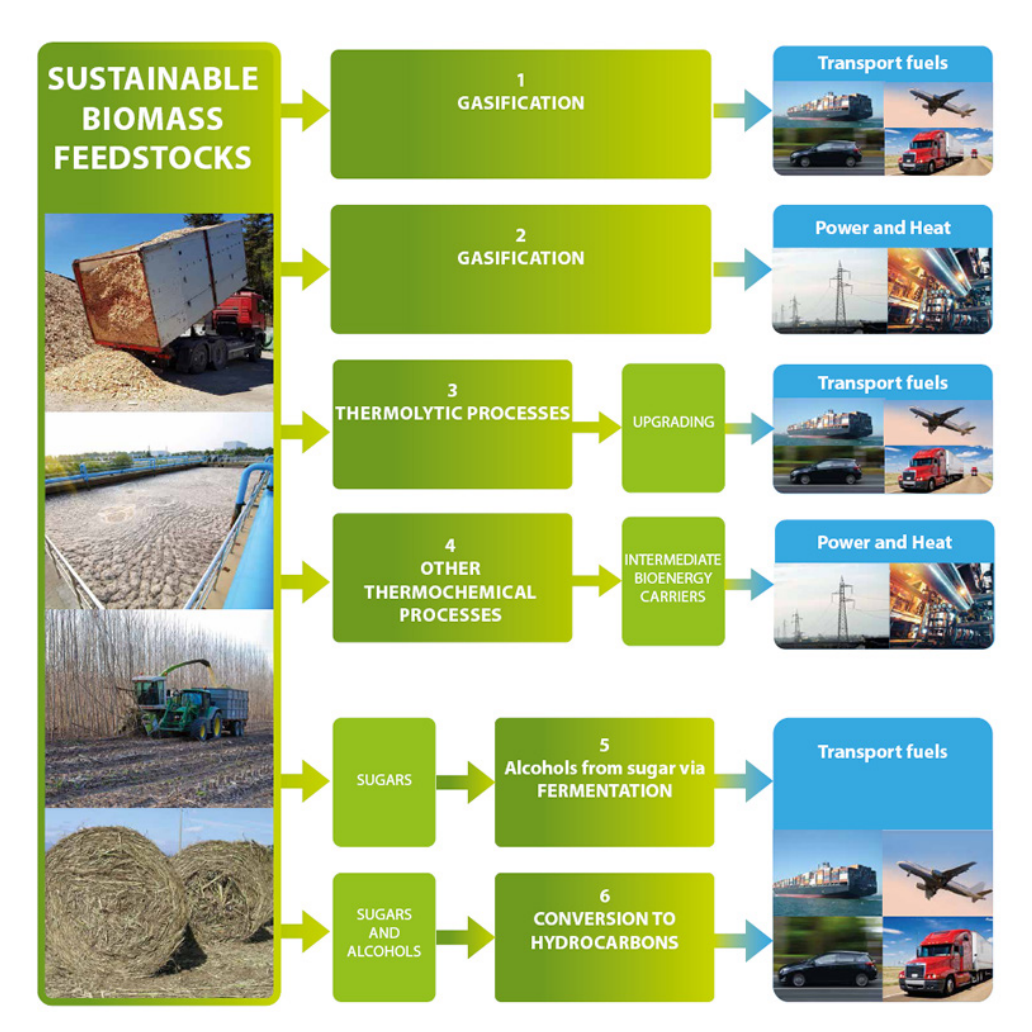
Figure 2: Priority Value Chains (PVC) as defined by ETIP Bioenergy

As this report focuses on the production of advanced biofuels (and not bioenergy or biogas), only the following pathways are fully covered: