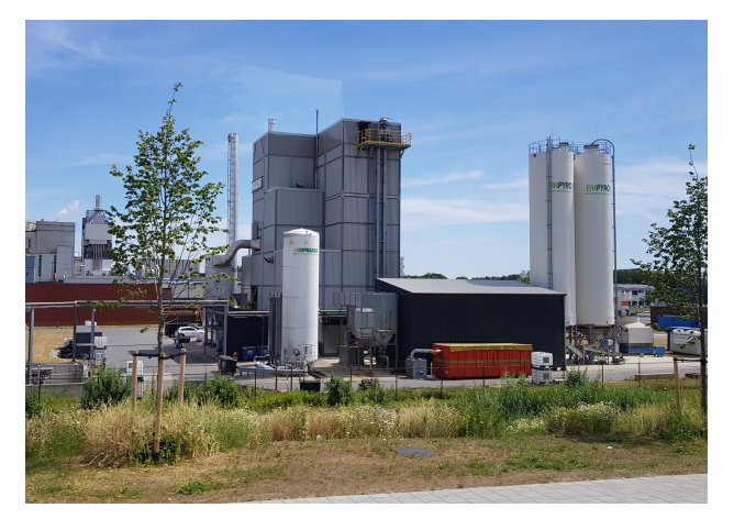
Figure 5: The Empyro pyrolysis plant in Hengelo (NL)