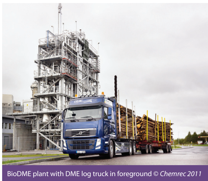
BioDME plant with DME log truck in foreground

The DME demonstration plant in Piteå, Sweden, which was put into operation in 2010, is the only gasification plant worldwide producing high-quality synthesis gas based on 100% renewable feedstocks. The raw material used is black liquor, a high-energy residual product of chemical paper and pulp manufacture which is usually burnt to recover the spent sulphur.